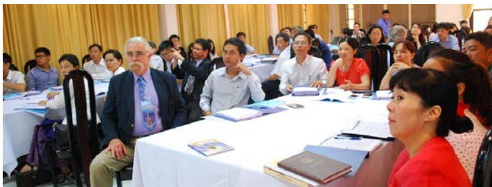
WHWB courses in Viet Nam and Tanzania

WHWB offers a mentorship program, through which highly trained and experienced volunteer professionals around the world mentor new professionals. Mentors and mentees meet regularly, usually through electronic communications, for educational and guidance sessions.